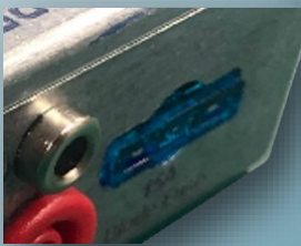
Integrated 15 A automotive blade fuse